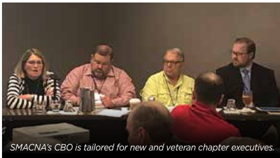
SMACNA’s CBO is tailored for new and veteran chapter executives.

Members may also subscribe to the Bargainers’ Listserv on SMACNA Connect at www.smacna.org/labor/bargainers-list-serve to receive timely settlements