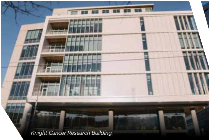
Knight Cancer Research Building.