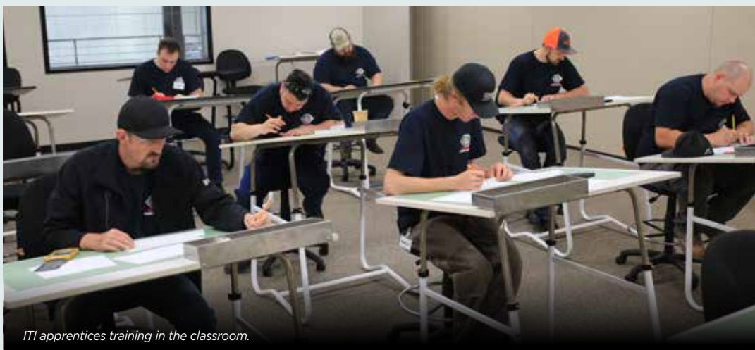
ITI apprentices training in the classroom.

SMACNA members are encouraged to educate their new members of Congress about this and other legislation that supports the industry. Members may contact them through SMACNA’s Take Action web page www.smacna.org/advocacy/take-action .