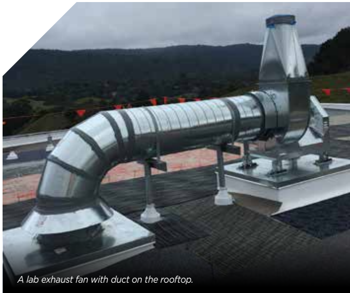
A lab exhaust fan with duct on the rooftop.