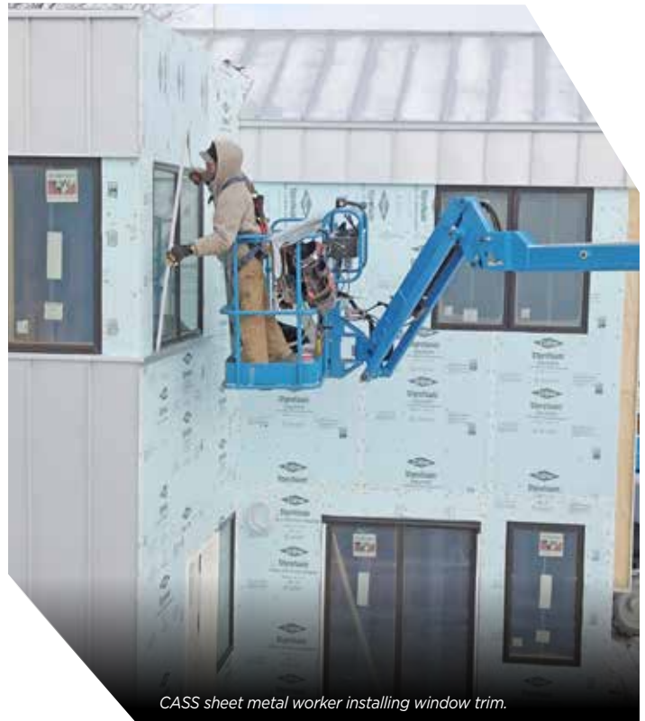
CASS sheet metal worker installing window trim.