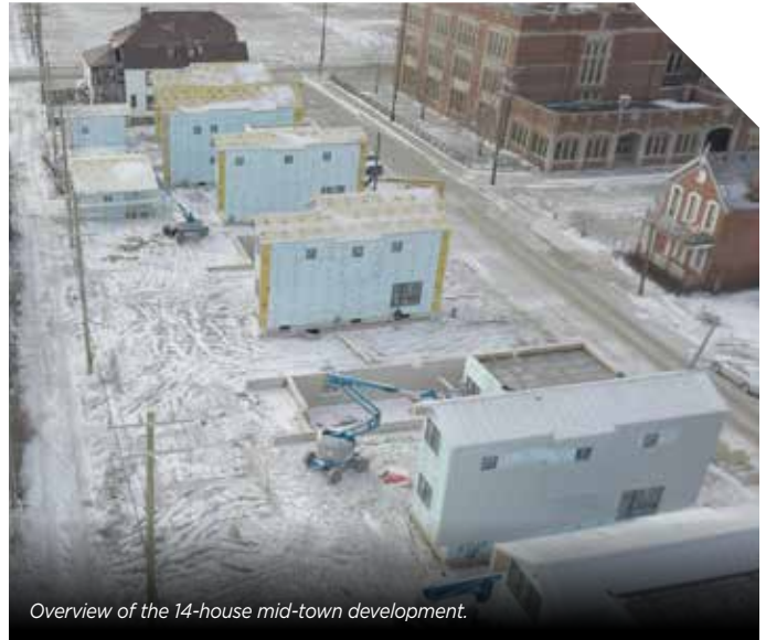
Overview of the 14-house mid-town development.