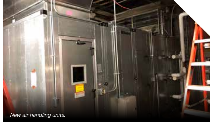
New air handling units.