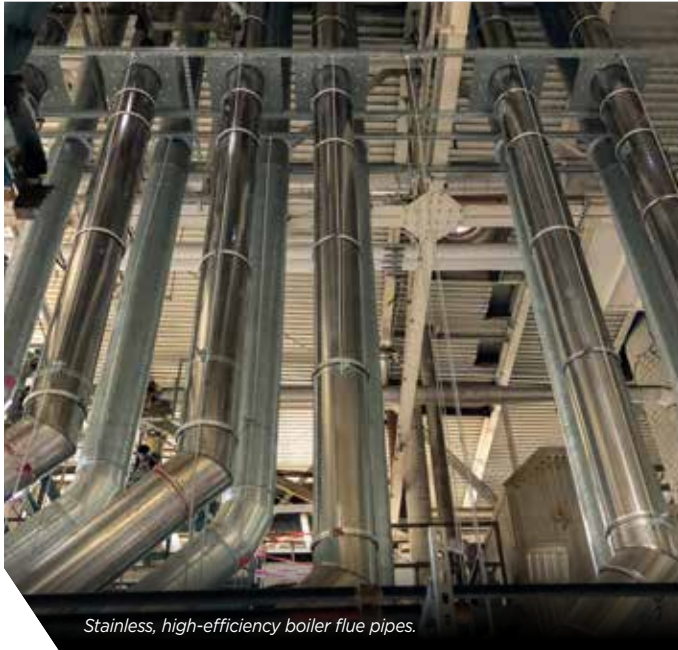
Stainless, high-efficiency boiler flue pipes.