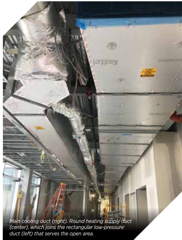
Main cooling duct (right). Round heating supply duct (center), which joins the rectangular low-pressure duct (left) that serves the open area.