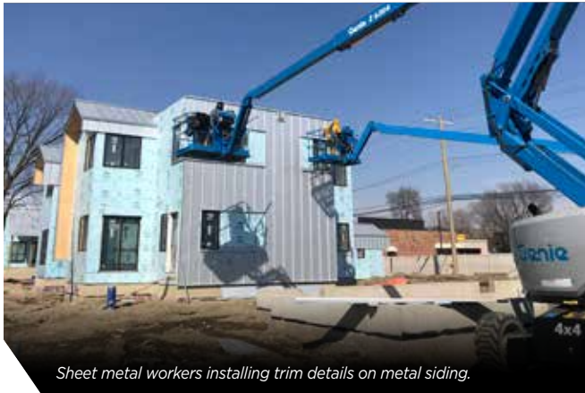
Sheet metal workers installing trim details on metal siding.