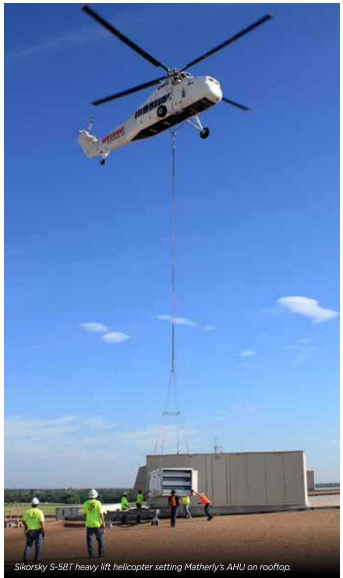
Sikorsky S-58T heavy lift helicopter setting Matherly’s AHU on rooftop.