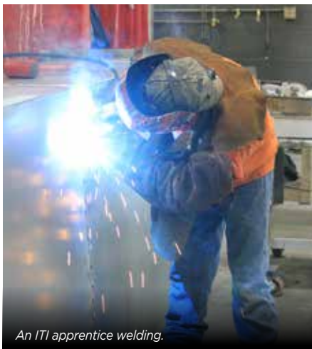
An ITI apprentice welding.

"One of our instructors led the sheet metal part of the program — a couple of nights' overview of what a sheet metal worker does, what kind of tools we use, and what kind of equipment is used on the job," he said. "We took them out and walked them through a basic shop project so they had something they could take home."