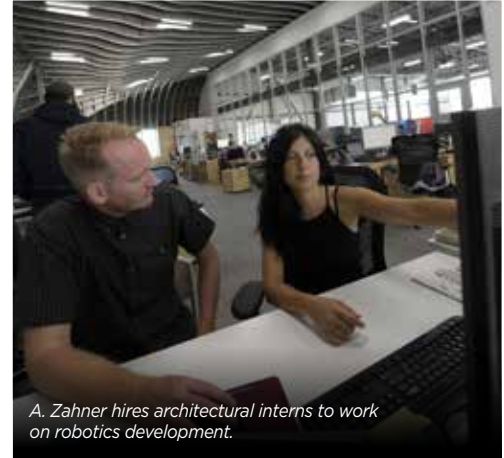
A. Zahner hires architectural interns to work on robotics development.