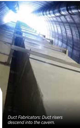
Duct Fabricators: Duct risers descend into the cavern.