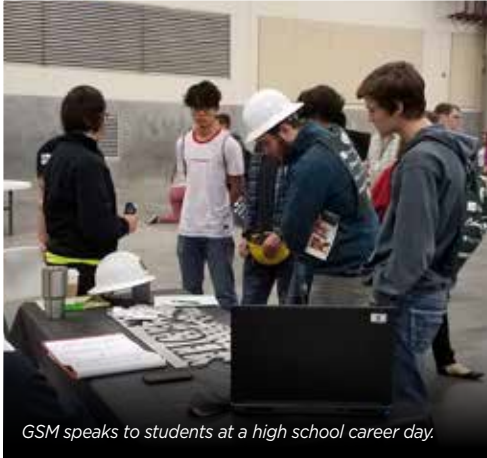
GSM speaks to students at a high school career day.