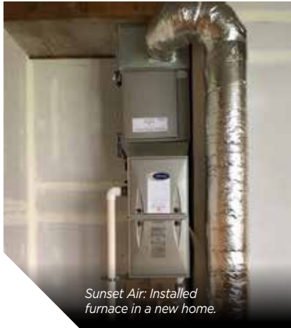
Sunset Air: Installed furnace in a new home.