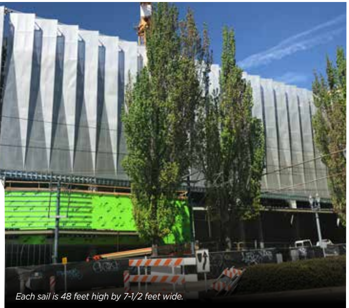
Each sail is 48 feet high by 7-1/2 feet wide.