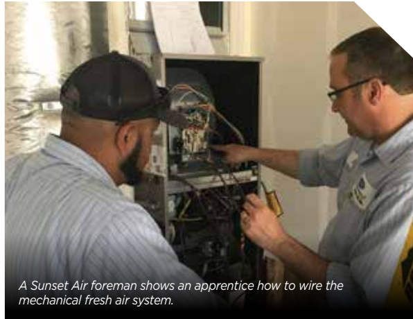
A Sunset Air foreman shows an apprentice how to wire the mechanical fresh air system.