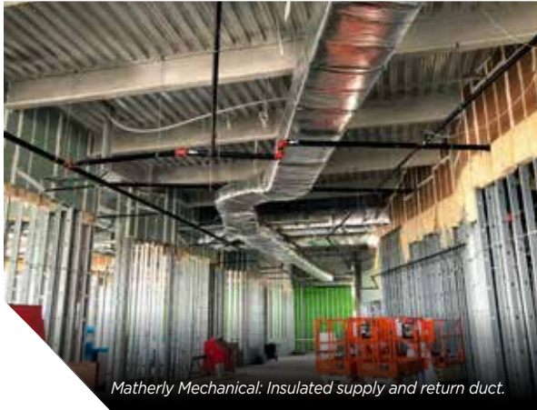
Matherly Mechanical: Insulated supply and return duct.