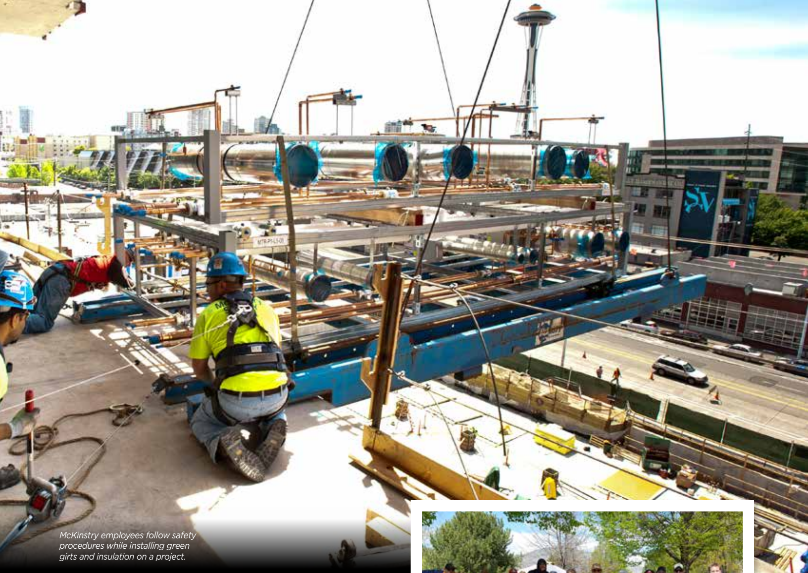
McKinstry employees follow safety procedures while installing green girls and insulation on a project.