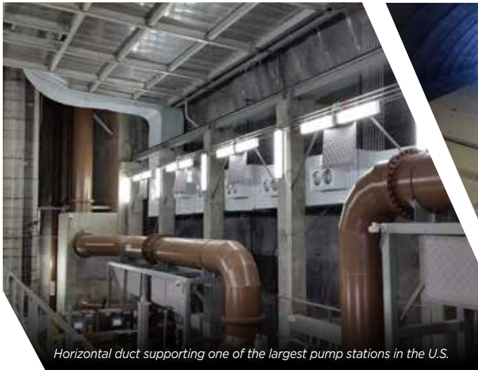
Horizontal duct supporting one of the largest pump stations in the U.S.