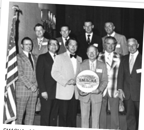
SMACNA of San Diego representatives at a SMACNA National Legislative Conference in the late 1970s.