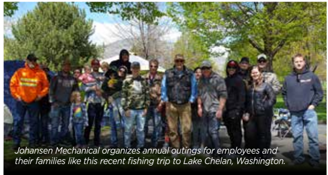
Johansen Mechanical organizes annual outings for employees and their families like this recent fishing trip to Lake Chelan, Washington.

of communicating. It's a survival mechanism because we have interaction between so many different disciplines."