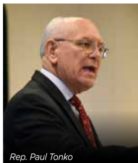
Rep. Paul Tonko