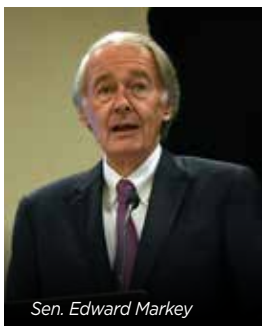
Sen. Edward Markey

Members may learn more and read the CEA issue sheets on the SMACNA website at www.smacna.org/advocacy/2018-issue-sheets .