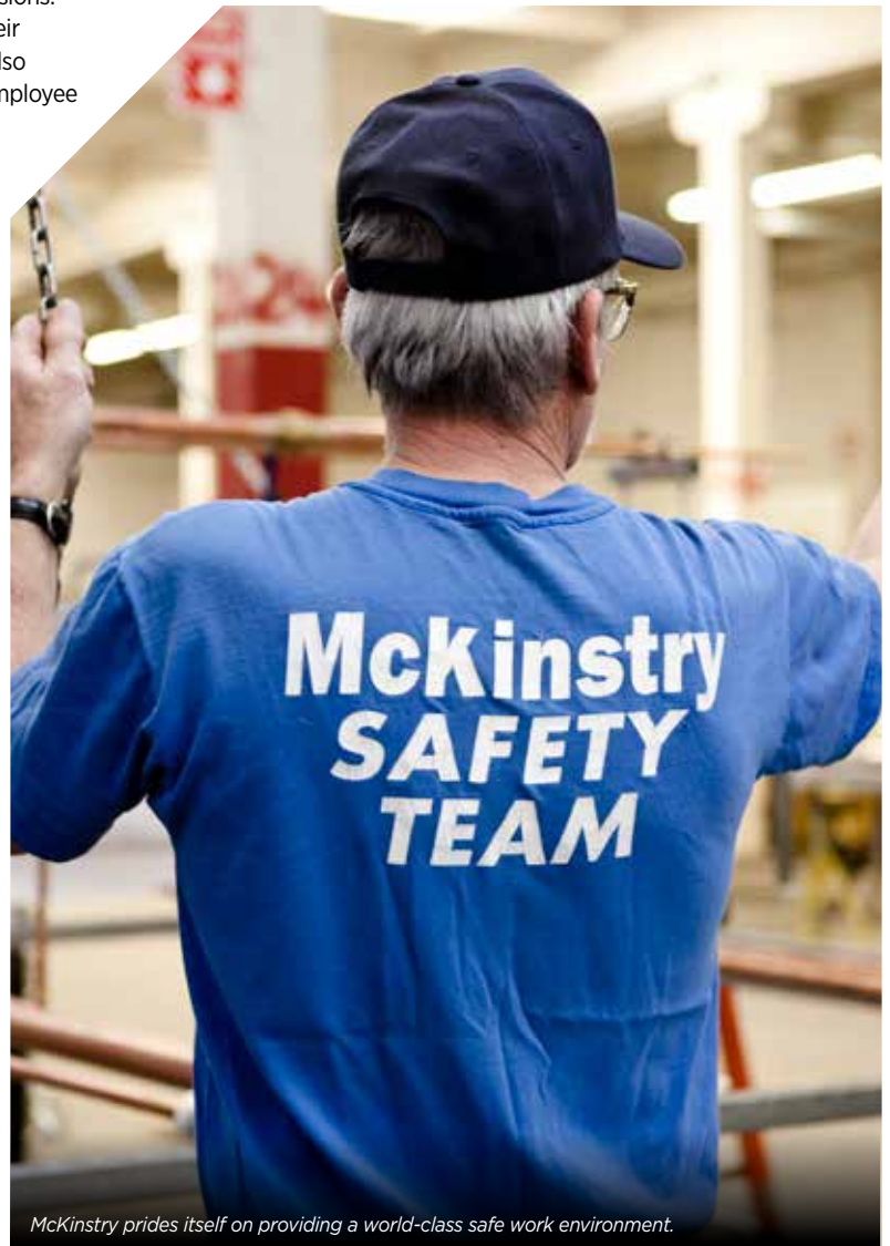
McKinstry prides itself on providing a world-class safe work environment.