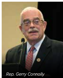
Rep. Gerry Connolly