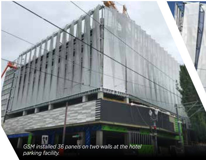
GSM installed 36 panels on two walls at the hotel parking facility.