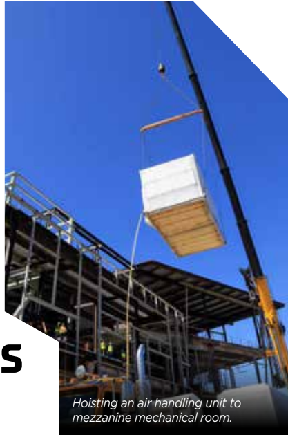
Hoisting an air handling unit to mezzanine mechanical room.