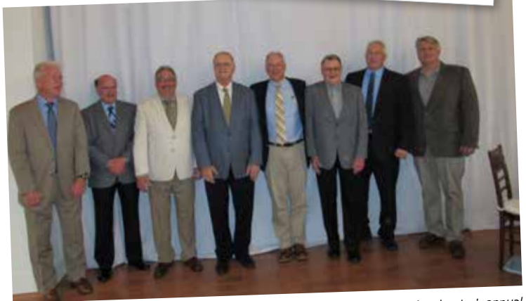
Past presidents of SMCA of Philadelphia and Vicinity were recognized at the chapter's annual meeting in 2018.